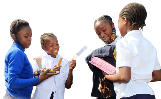
Photo (right) Students get ready for classes as part of Nyiragongo eruption relief. Displacement greatly affects access to school, especially for girls.

ECI works with communities in eastern Congo as they build a future of health, freedom, and prosperity for life. Shoulder to shoulder with Congolese innovators, we will revolutionize how the world thinks of and approaches humanitarian aid.